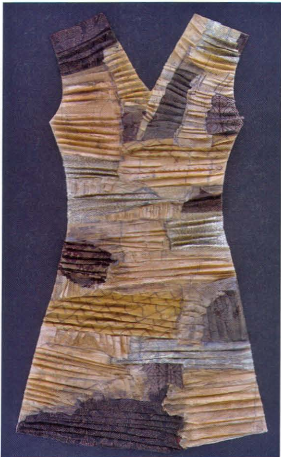
ABOVE: Marilyn Stevens, Ripple Effect , 2006; collage with fabric and paper, 45" x 26".

using recognizable images and objects, she allows viewers to form their own personal connections to the works.